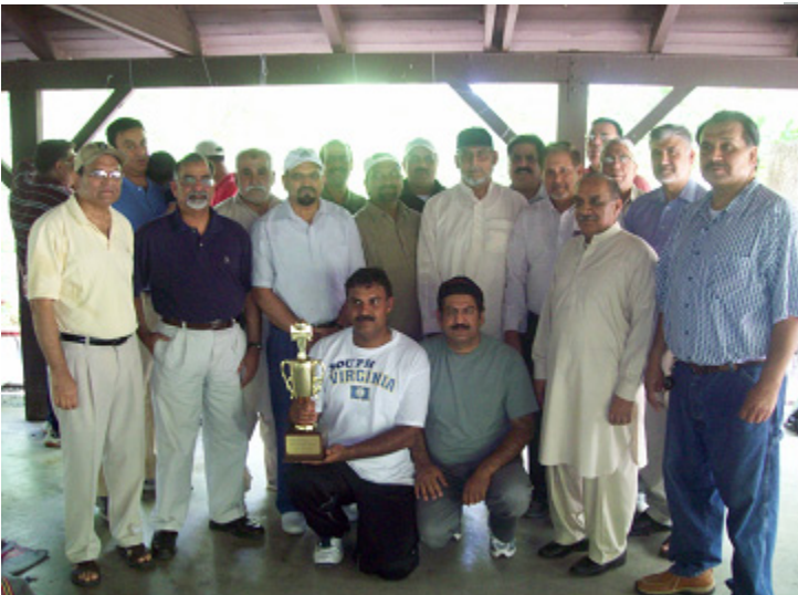
South Virginia Majlis' Volleyball team who won the first-place trophy at Regional Ijtema of Headquarters and Virginia Regions

The 28 th National Ansarullah Ijtema and 17 th National Shura will be held on Friday, October 16 – Sunday, October 18, 2009 at Baitur Rehman Mosque, Silver Spring, MD. Ansar are urged to attend the Ijtema and also encourage their fellow ansar brothers to attend this important event.