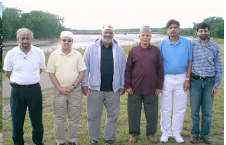
Ansar of St. Paul Majlis at their annual picnic held on Aug. 1, 2009