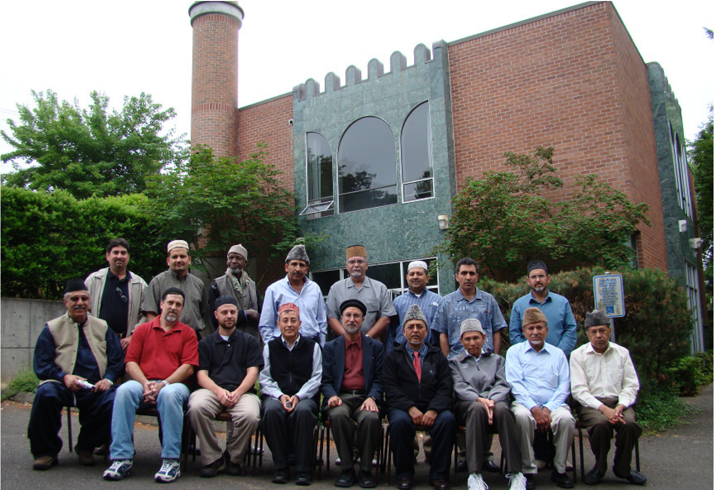
Ansar at North West Regional Ijtema held on June 14, 2009 at Rizwan Mosque, Portland

Orlando Majlis arranged a Tabligh stall at a local Flea Market on June 6, 2009. More than 30 people visited the stall. About 20 people accepted literature including flyers in Spanish and Bosnian languages. Information about Jama'at's English and Arabic web sites were also given to visitors. Various books including The Holy Qur'an, Philosophy of the Teachings of Islam, and books about Jihad were given to visitors. Live MTA and Jama'at's web site were displayed on a computer. Discussions about various aspects of Islam were also carried out with visitors.