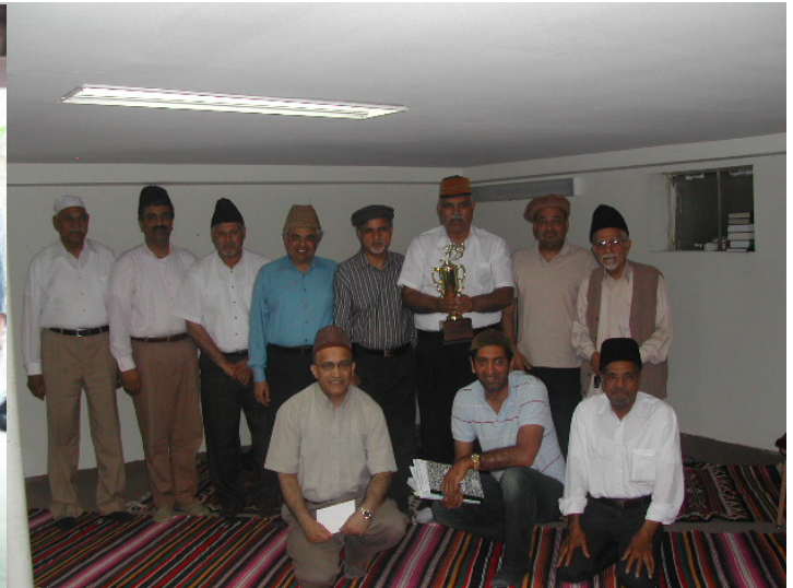
North and Central Virginia Majalis' Tug of War team who won the first-place trophy at Regional Ijtema of Headquarters and Virginia Regions